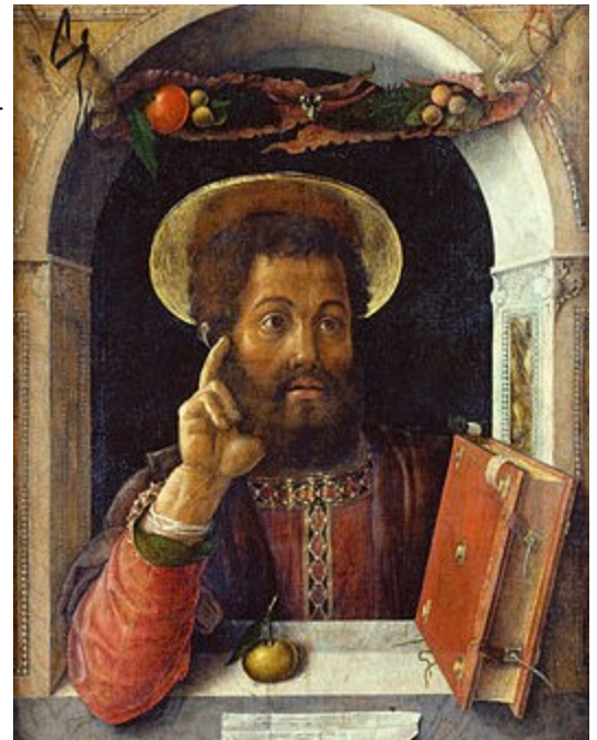
A painting of Saint Mark by Italian painter Andrea Mantegna, painted around 1448.

The instances of being amazed number 16. The instances of fear number 17. Such is Mark’s fearsome wonder.